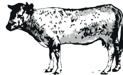
STEAK/BARBACOA (STK/BAR) (ADD 75P)

MARINATED BRITISH ISLE GRILLED OR PULLED BEEF