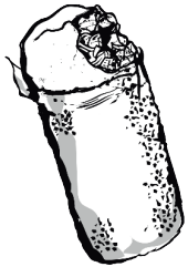
BURRITO (B) M £5.80 | L £6.80

TORTILLA WRAP PACKED WITH TASTY FILLINGS OF YOUR CHOICE