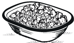
NAKED BURRITO/SALAD (NB) M £5.80 | L £6.80

TORTILLA WRAP PACKED WITH TASTY FILLINGS OF YOUR CHOICE